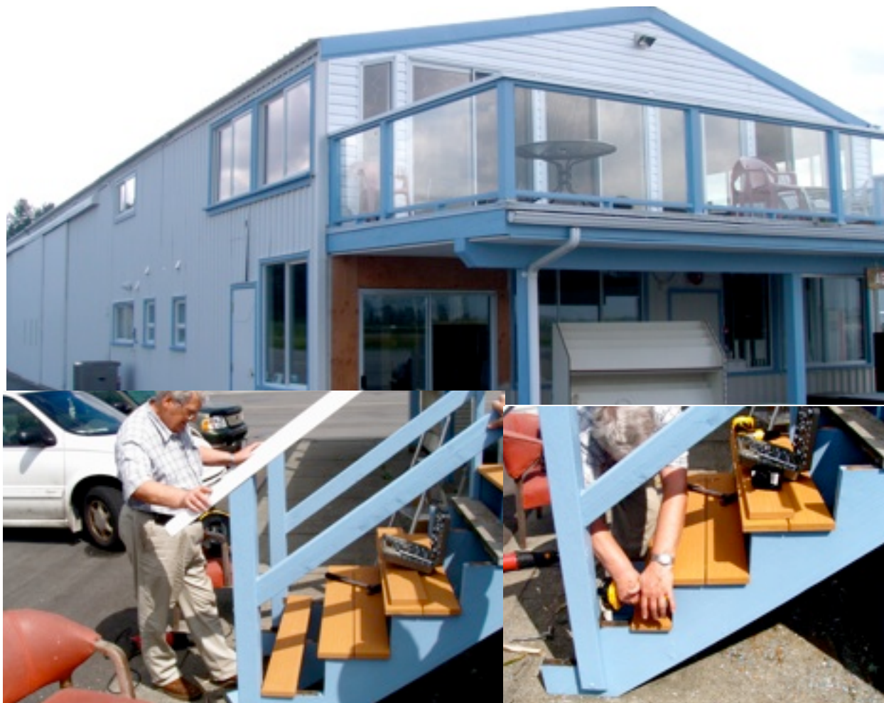
Jim Zeilstra installed new high tech composite steps, guaranteed not to rot.

Windows complete, outside painting done, work on pilots' lounge ongoing.