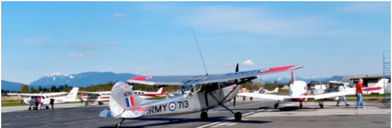
Poker run pilots lining up of discounted fuel, (even the army?)