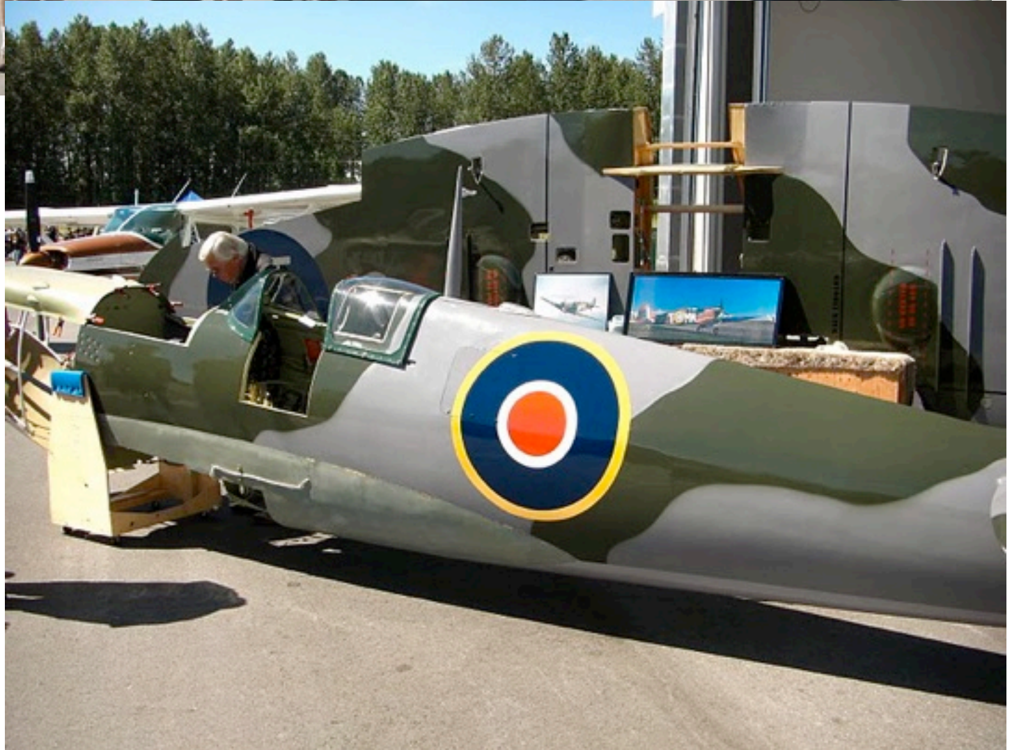
Above - 8/10 scale Spitfire replica being built by the Foleys. Horst Romani persuaded a bunch of his classic car friends to come with their classic, antique, and hot rod cars. The train ride driven by Gary West was very popular with kids and adults.